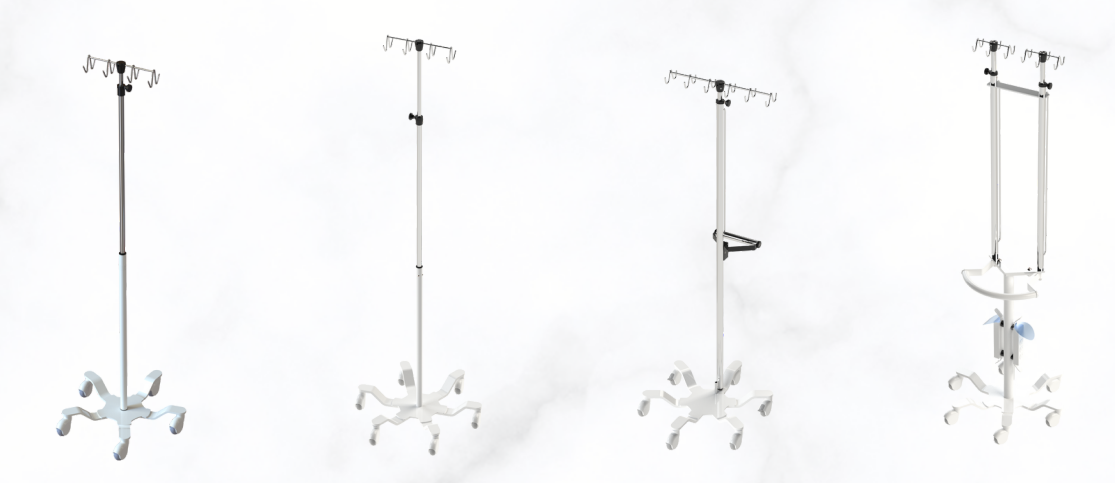
ITEM # 135G 176G 178G 910G