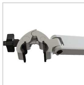
The IV Pole Clamp