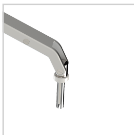
The Bed Pin