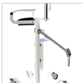
Attached to IV Pole