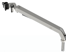
Universal Bed Transport System QK-IT01 (Speed Clamp)

During the transport process the risk of a lagging, unattended IV pole that is connected to the patient with one or more lines active can lead to painful, traumatic and potentially life-threatening consequences. The C-level executives will appreciate the team's thoughtful consideration in taking every precaution to avoid these risks on a daily basis. Your patients will appreciate their uneventful, safe arrival for their next procedure.