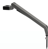
Universal Bed Transport System QK-IT02 (Permanent Mount)