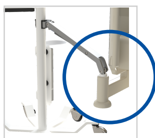
Fully Couple Position

(Patient bed frame must have mount hole)